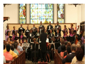
Bel Canto Singers Nassau, Bahamas

Gifts to Coalition for African Americans in the Performing Arts (CAAPA) are tax-deductible to full extent of the law. CAAPA is nonprofit, 501(c)(3) organization (FEIN 26-0093440).