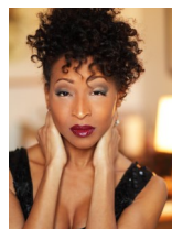
N'Kenge Broadway soprano