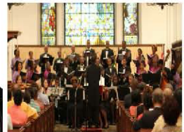
Bel Canto Singers Nassau, Bahamas