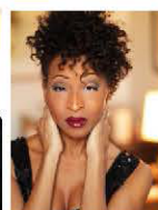
N'Kenge Broadway star